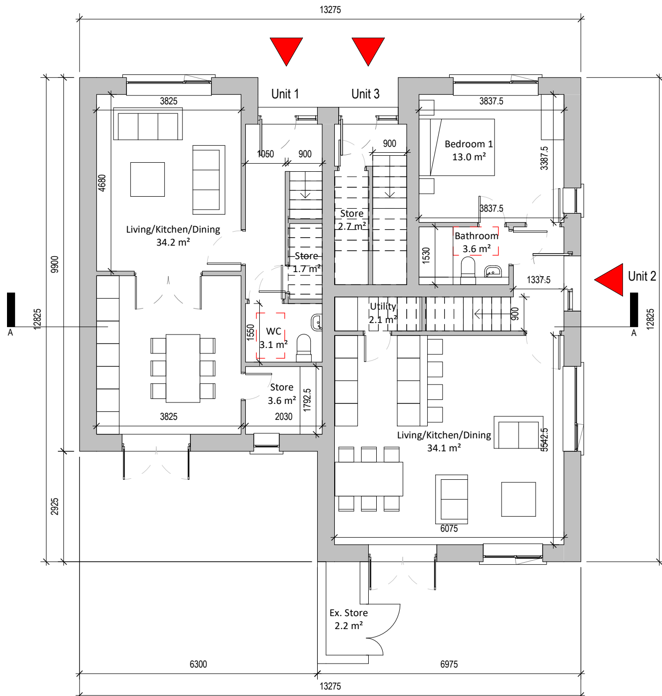
① Ground Floor 1 : 100