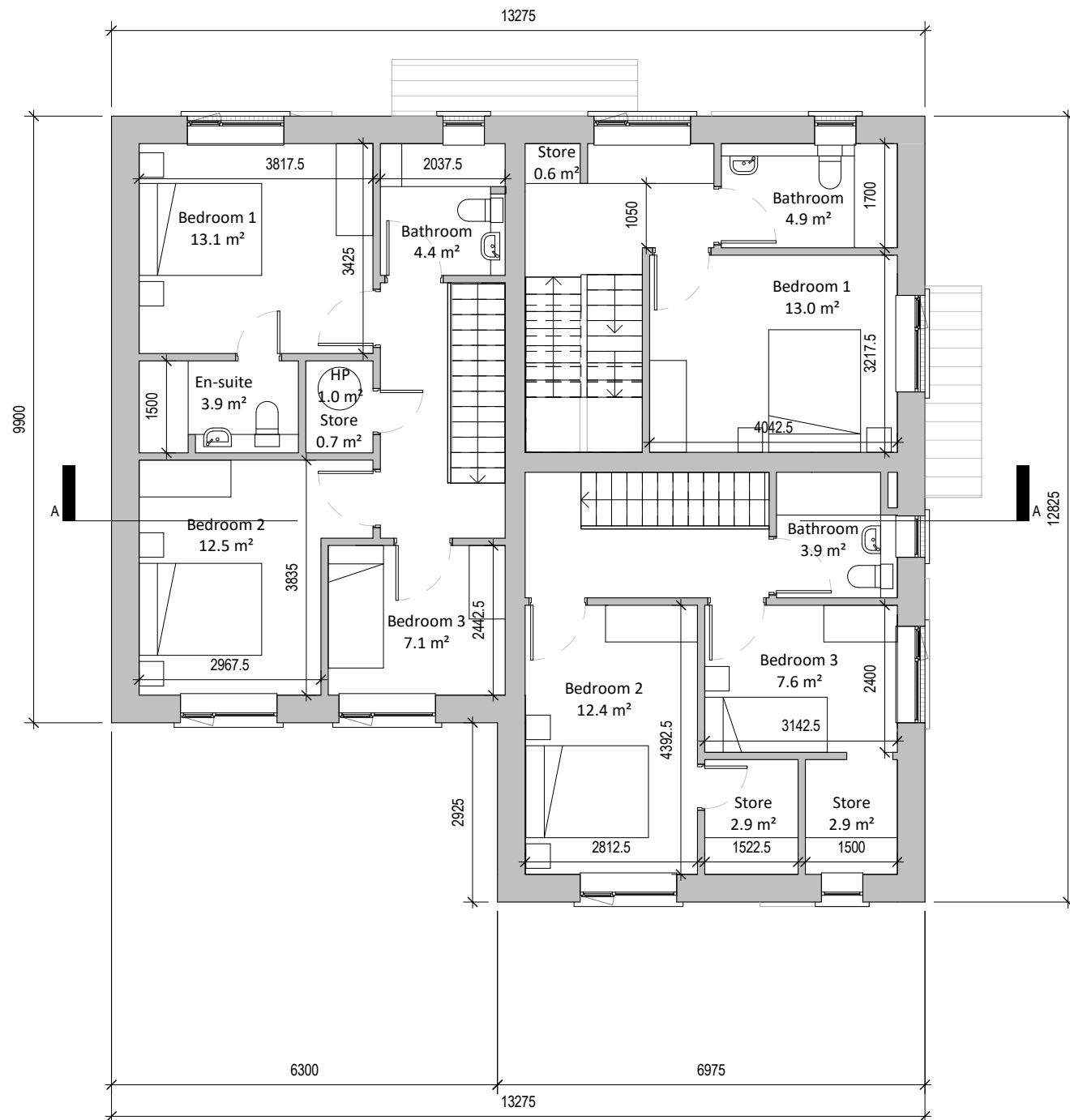
② First Floor 1 : 100